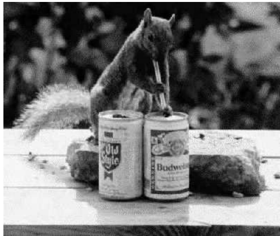
Hmm Taste Contest.

If you would like to share your Experience, Strength and Hope or recognize someone that is going the extra mile and want it in the Mailbox, please have it in the Interoffice by the 10 th of the month or email at lai111@sbcglobal.net